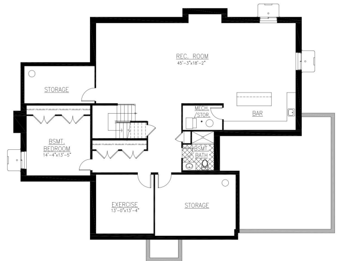
Finished Basement Plan Drawing

Options Not Included In Sales Price: Master Bath Shower Seat, and Master Bath Free Standing Tub